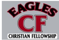
Gray & Oxford/Bl.